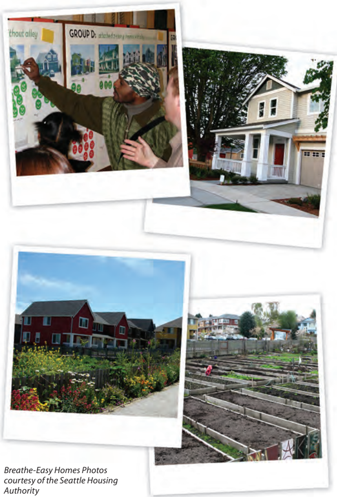
Breathe-Easy Homes