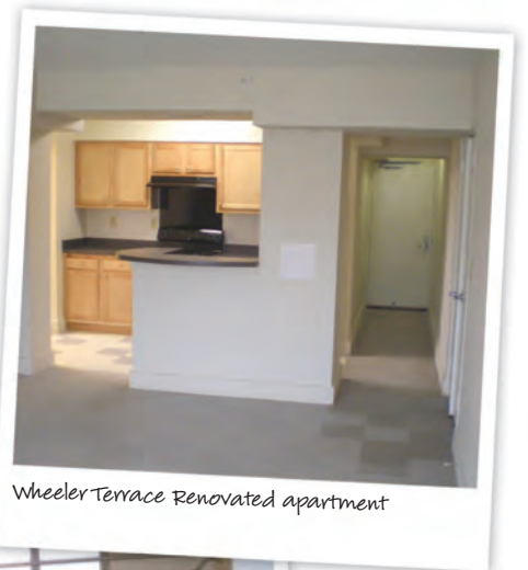
Wheeler Terrace Renovated apartment

The evaluation of how the green and healthy features integrated into the Wheeler Terrace rehabilitation are impacting resident health and exposure to allergens is ongoing. Post-renovation interviews with residents and analysis began in fall 2010 and will be completed in 2011. In addition to the evaluation, NCHH is training several residents as Community Health Workers (CHW) to provide healthy home information to other community members. Heightening the resident connection and encouraging peer education should help build resident engagement in maintaining healthy homes.