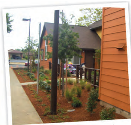
Nuevo Amanecer Landscaping and walkways