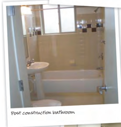
Post construction bathroom