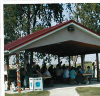
Viking Terrace's New Picnic Shelter

Not all the projects started out with green in mind. Viking Terrace had considered some energy efficiency improvements during its renovation planning, such as geothermal heating and cooling, but could not get the necessary financing. Were it not for an intervention by Enterprise Community Partners they would not have been able to "go green" due to the increased costs associated with green building.